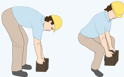
Use the muscles in your legs to help lift a heavy item.

Disk replacement. This procedure involves removing the disk and replacing it with artificial parts, like replacements of the hip or knee.